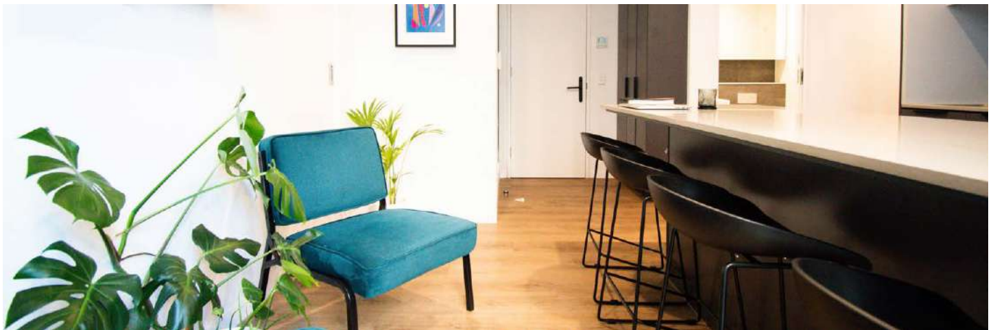
This is a photo of our 6 Bedroom Apartment and is indicative only.

Don't forget that each room also has its own study desk and storage area if you need time and space to yourself.